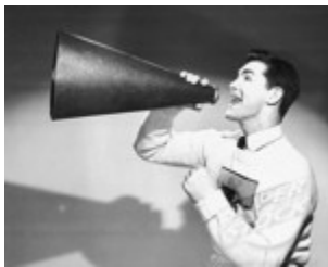
Guy with a megaphone.

Consider that KDKA, the nation’s first radio station, didn’t begin broadcasting from the Westinghouse factory in Pittsburgh until November of 1920, and the first football game broadcast – West Virginia at Pitt – wasn’t until October of 1921. It didn’t take long for the new medium to explode in popularity, but the Rose Bowl wasn’t broadcast nationally until the 1927 game pitting Alabama and Stanford.