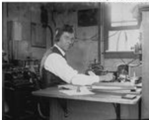
A telegraph operator.